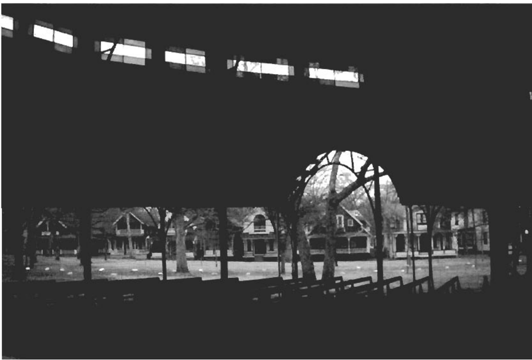
Oak Bluffs, meeting place of space in the landscape.

The young collect on the corners and the old still stroll to the plaza.