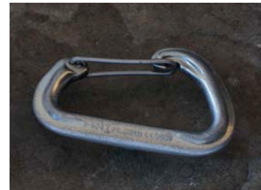
Wire gate karabiner