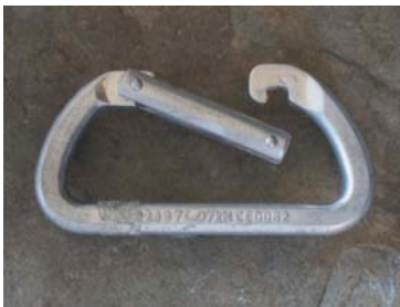
Straight gate karabiner

That karabiners fail with their gate open is not surprising given that the tensile strength of a karabiner with an open gate is typically 7 kN as opposed to 25 kN for a karabiner with the gate closed. What is less obvious is how the gate was open when the karabiner failed. The two possible scenarios involve the gate being open before the fall which caused failure of the karabiner, or whether the act of falling itself in some way led to the opening of the gate and the subsequent failure of the karabiner. The aim of this analytical study is to investigate whether the karabiner gate could be excited and induced to open by oscillation of the rope.