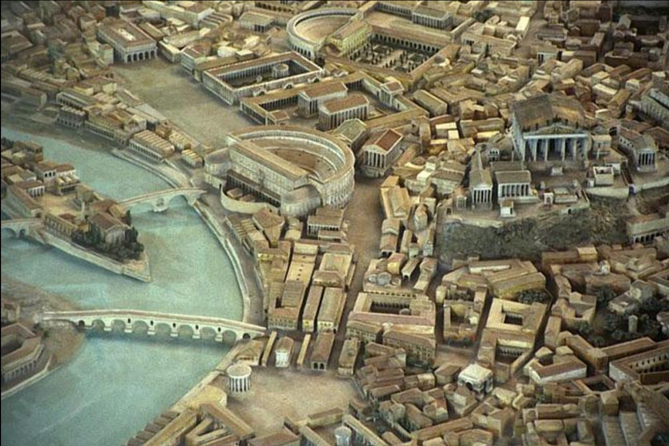
Image courtesy of Alessandro57. This image is in the public domain. Source: Wikimedia Commons .

Reconstruction in Museo della Civiltà Romana