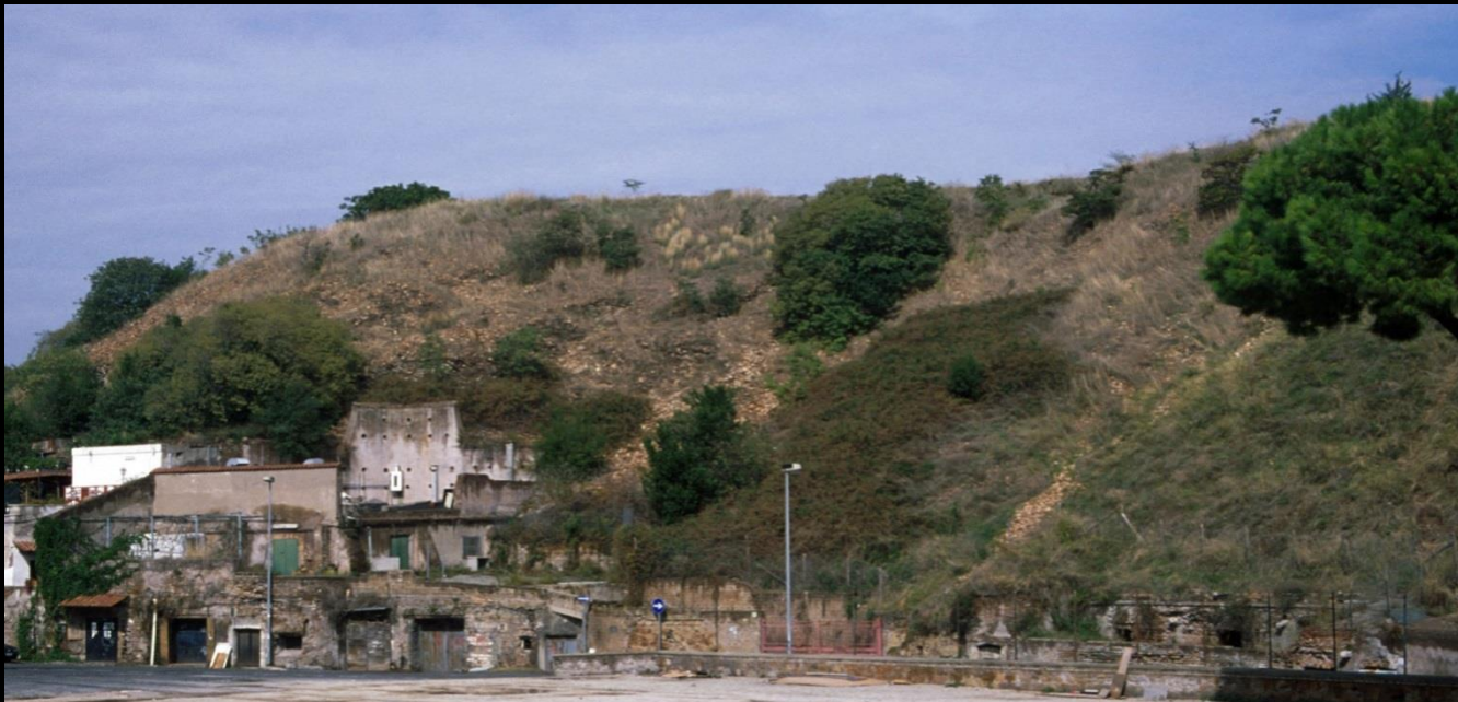
License CC BY.

This image is in the public domain.