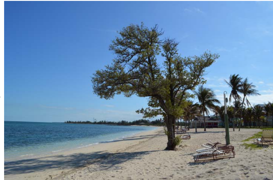
License CC BY.